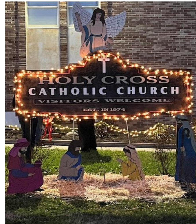
Advent... waiting for Jesus to arrive.

Second Sunday of Advent Vigil, December 9, 2023