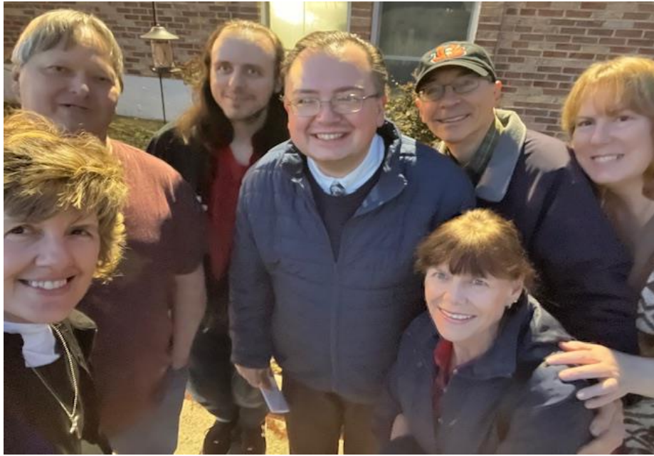
Thank you, Decorating Crew... Christmas outside Holy Cross Church looks beautiful!