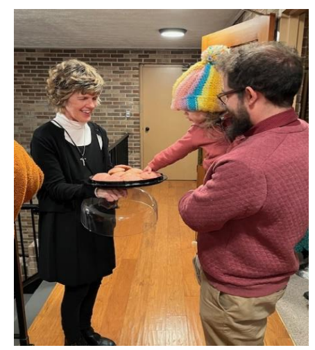
Welcome, visiting work group. Come back soon!