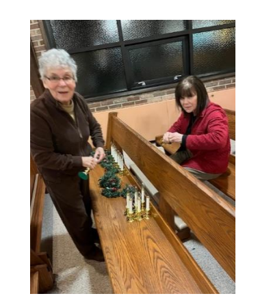
Thank you for your ministries!