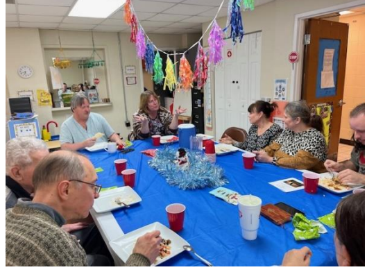
January pot-luck – Tocos and fellowship!