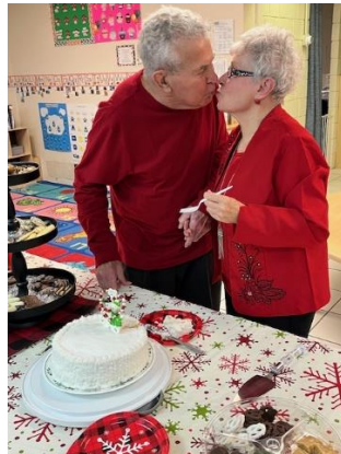
Congratulations and Blessings!