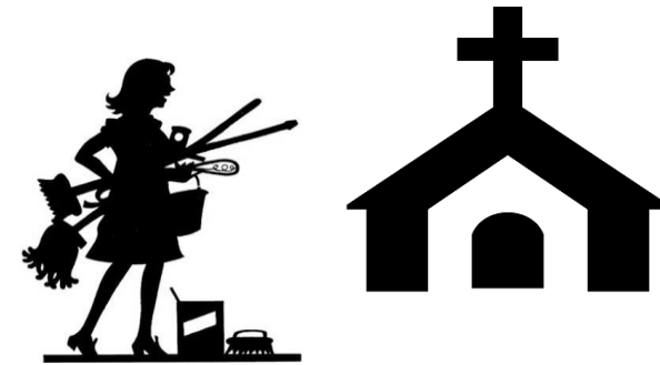
Let's keep our Church clean!

"Lord, every nation on earth will adore you."