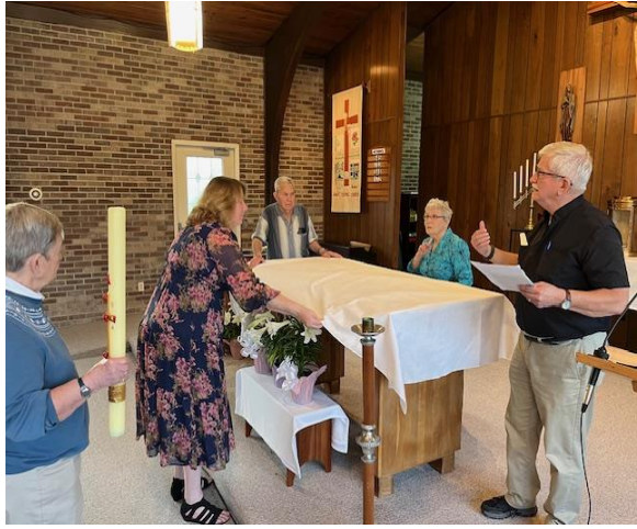
Preparing for Easter.